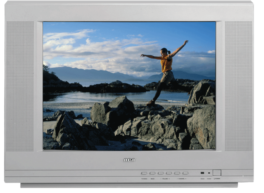
Product Size (H x W x D): 18 x 23.8 x 20 inches